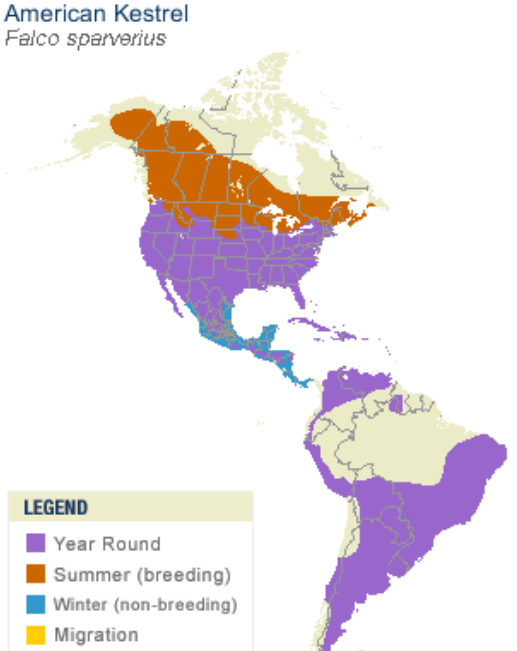
Map by Cornell Lab of Ornithology Range data by NatureServe